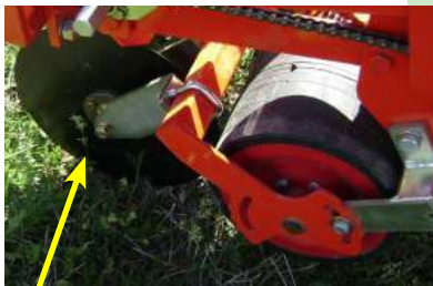
adjustable front opening disc (optional)