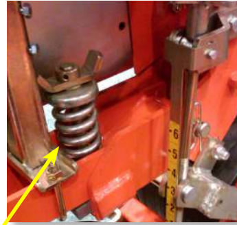
adjustable tension/parallelogram for constant planting depth