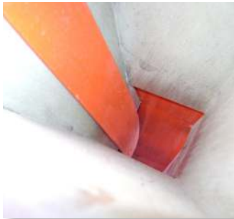
larger throat for plant to fall through