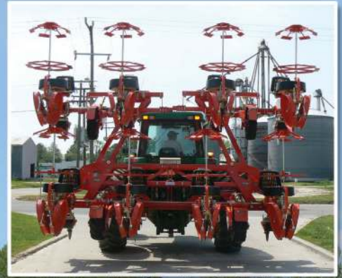
optional hydraulic fold 4, 6, or 8 row