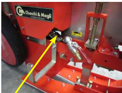
adjustable water trip (optional)