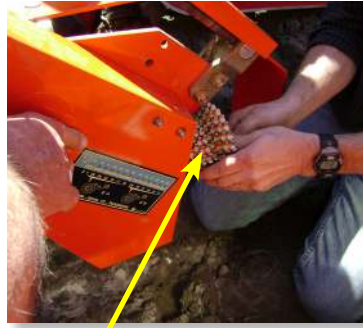
easy to change plant to plant spacings