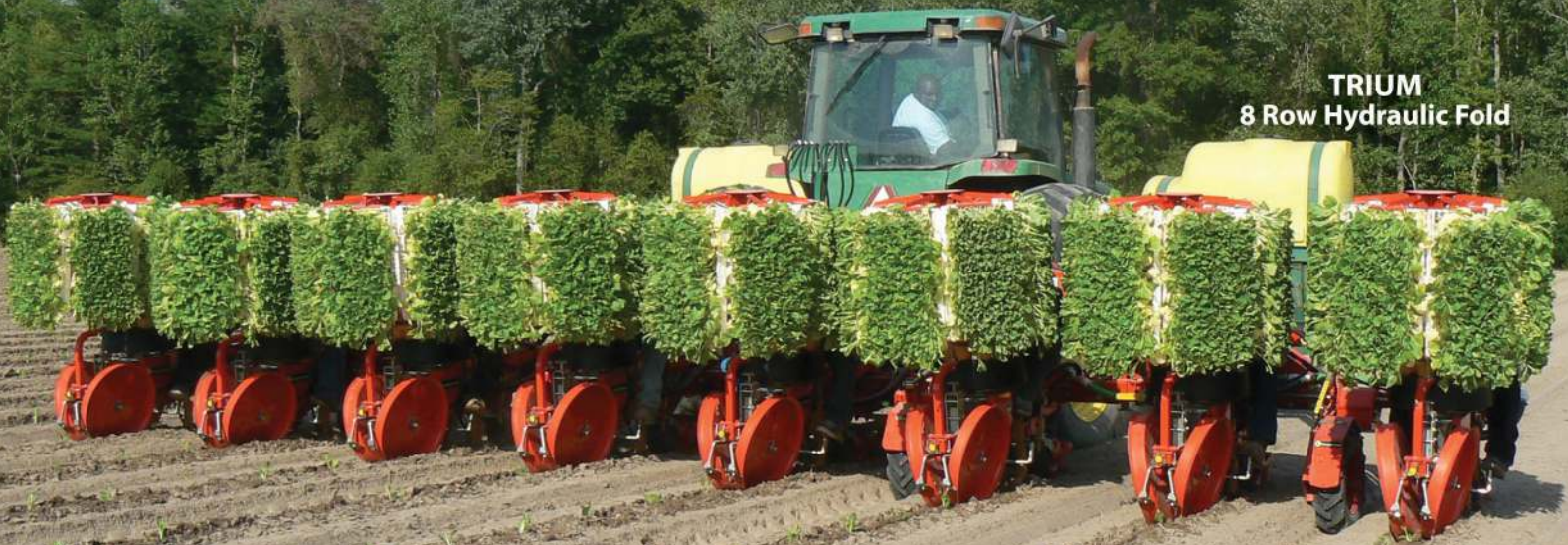
TRIUM 8 Row Hydraulic Fold