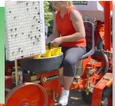
cup extensions for taller plants are standard on all TRIUMS

Our most popular model for tobacco is the TRIUM-- Available in 1, 2, 4, 6 or 8 rows